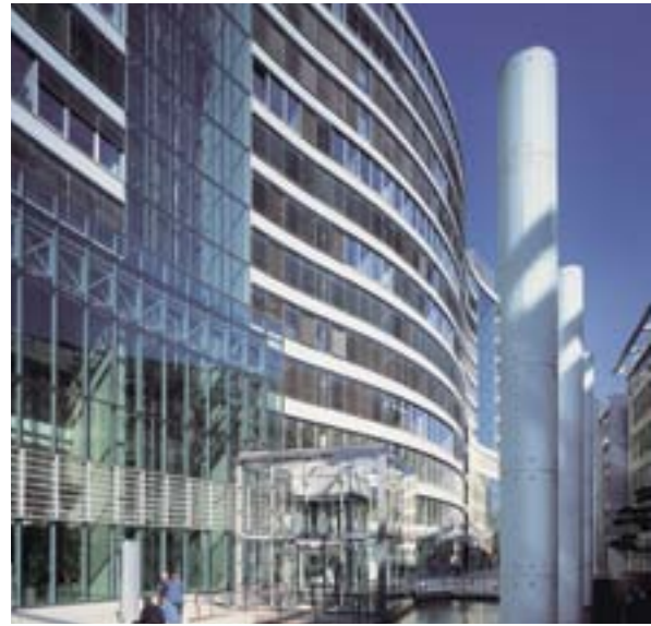
Frankfurter Welle, Frankfurt Total elevators: 36, of which 7 KONE CTU elevators were used during construction.