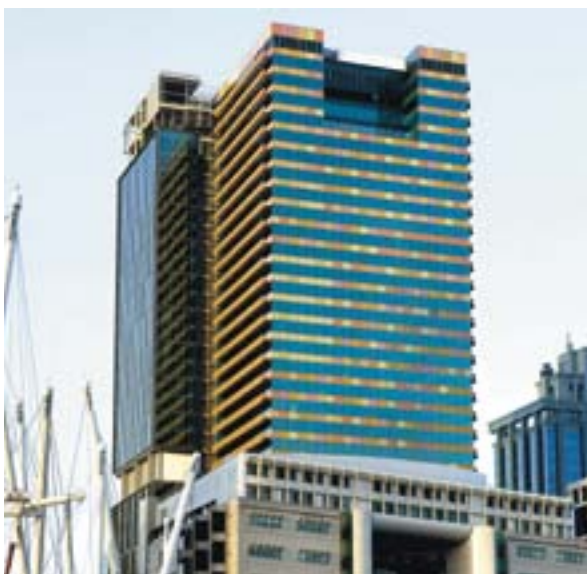
Northbridge, Brisbane Australia Total elevators: 18, of which 1 KONE JumpLift and 3 KONE CTU elevators were used during construction.