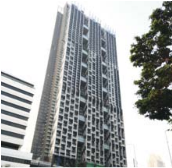
The MET, Bangkok, Thailand Total elevators: 23, of which 3 KONE JumpLifts and 2 KONE CTU elevators were used during construction.

KONE construction time solutions have been proven in hundreds of projects worldwide. KONE invented the JumpLift, and we have a proven track record with it on projects worldwide. Over the years KONE has continued to improve its CTU products, making them faster, more reliable, and able to serve higher buildings.