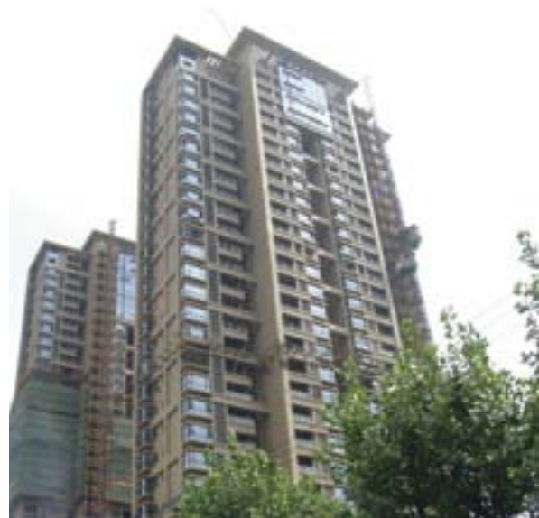
Rui Hong Xin Cheng project, Shanghai Total elevators: 4. 4 KONE JumpLifts were used during construction.